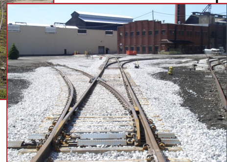
Before & After