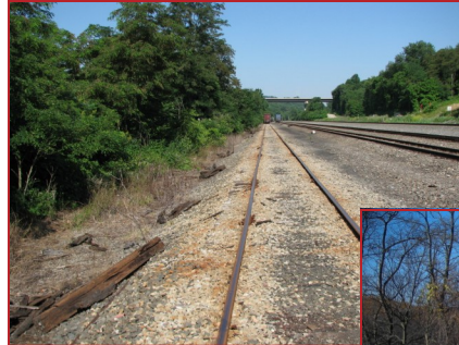
Radebaugh Interchange Siding Before & After