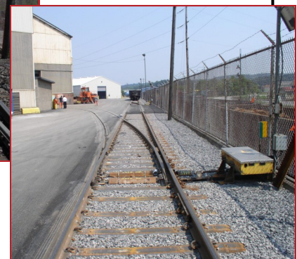
Before & After