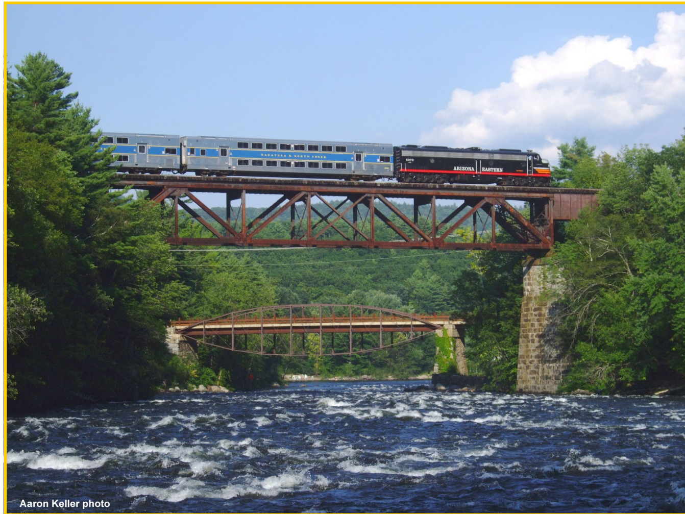
Saratoga & North Creek Railroad at the Sacandaga River bridge.